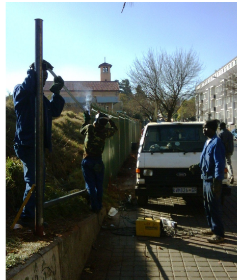
Workers put up the fence around the sportsfield - YSF managed to get JDA to fund the project