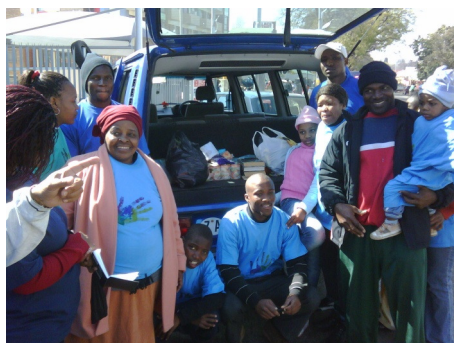
YSF team collects money and food on Mandela Day

In closing, he urged everyone to enjoy his or her holiday season and not to drink and drive.